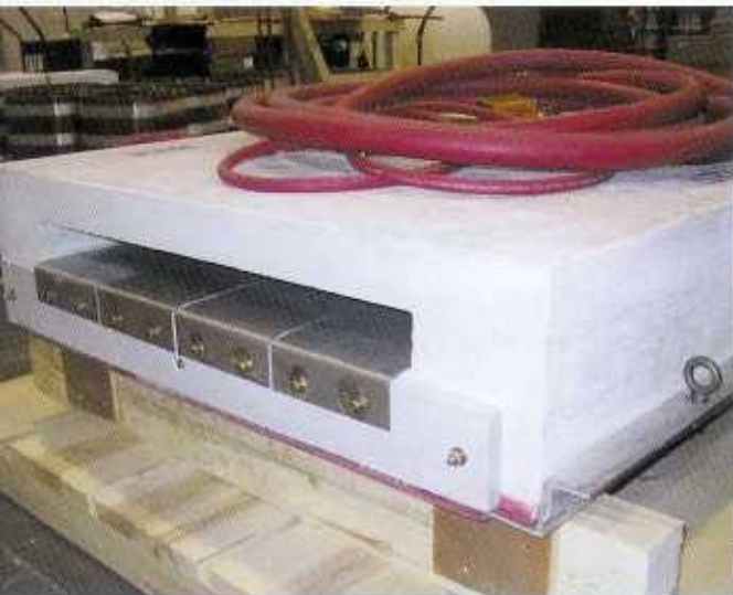
Ajax TOCCO Magnethermic wide oval cast coil for heating 6 to 12 strands of rebar prior to fusion bond epoxy coating.

Ajax TOCCO Magnethermic pipe coating installations are in almost every part of the world. These installations include processing of a wide variety of materials including epoxy, polyethylene, varnish and others with a wide range of curing temperatures.